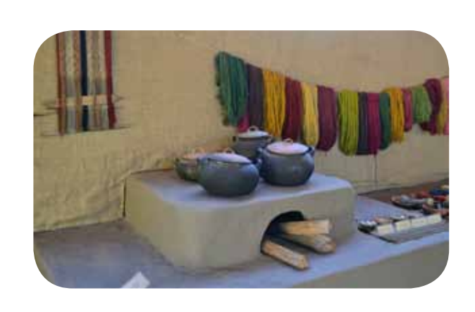
Day 5: March 17, Monday (el lunes)

After breakfast we'll gather for more time with Cat and our knitting, and then stroll to Michell's Mundo Alpaca . You can browse the shop, art gallery, pat llamas and alpacas, watch demonstrations, and view the museum displays until we will gather in the courtyard for a light lunch together. Afterwards, you are on your own to continue exploring the endless nooks and crannies and charms of our neighborhood.