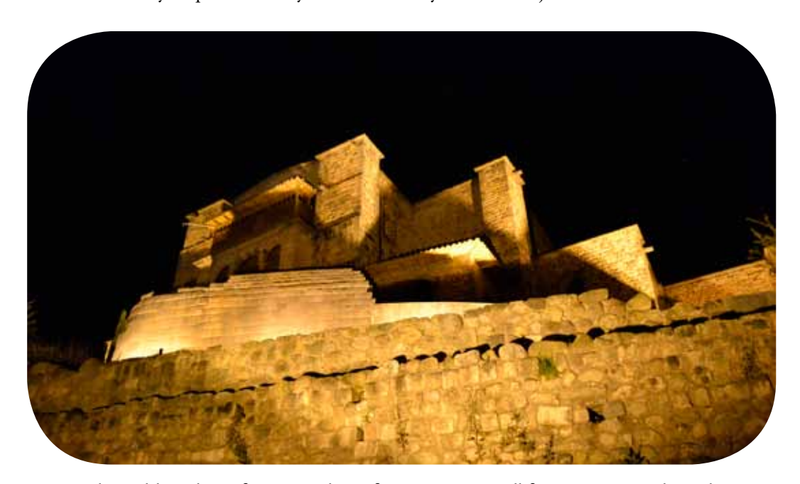
The golden glow of Qoricancha, a few minutes' stroll from our Cusco hostal.

We've had many requests, so if you are certain you want to join us, do contact us soon.