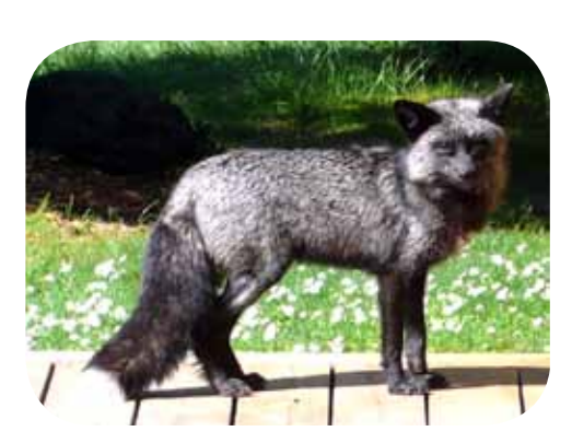
This shy fox appeared outside a knitter's window.

To register, email me at cat@catbordhi.com to find out if the retreat you want has space. If it does, I will ask you to print and fill out the registration form on page 4 and send it to me with your deposit to reserve your spot. The balance will be due 3 months before your retreat begins. I do keep a wait list (cancellations do come in, often within a month or two of the event, so if you have a flexible schedule you are most likely to get in). I hope to see you at one of my 2015 retreats, to share our beautiful island with you, and to enjoy getting to know you as we spend time knitting together.