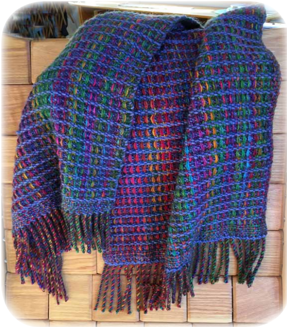
This throw uses a fun pick-up stick technique that last year's new weavers fell in love with.

Sessions 1 and 2 are for brand new weavers and sessions 3 and 4 are for returnees and adventurous newcomers (I'll teach all fundamentals in both sessions). The adventurous newcomers can then be tempted by advanced possibilities, like log cabin threading and who knows what else!