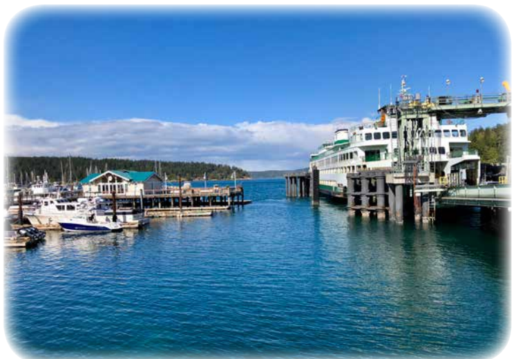
The view from our hotel

Questions? Call the Island Inn at 360.378.4400