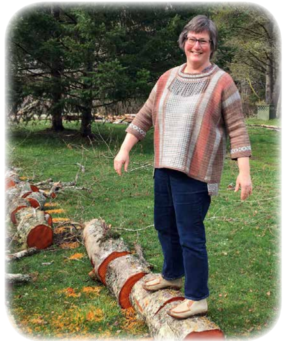
One of the patterns you will receive at the retreat is for this tunic (see detail below).