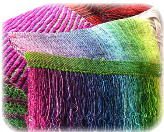
Color makes simple weaving glorious