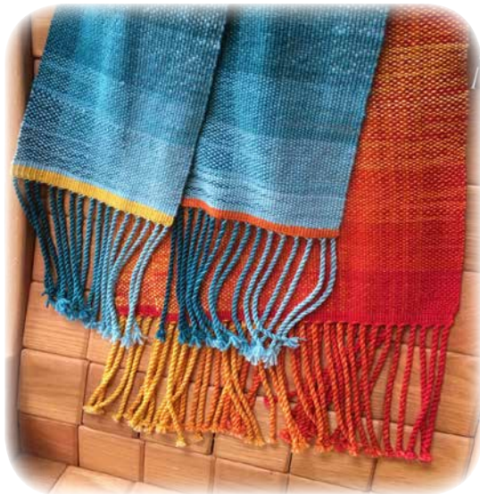
Many new weavers used Island Wools' color gradient yarn kits to make elegant scarves.