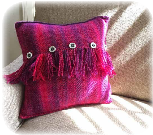
Enchanting pillows, easy to weave