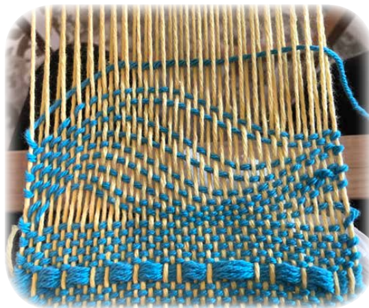
Playing with pick-up sticks and waves