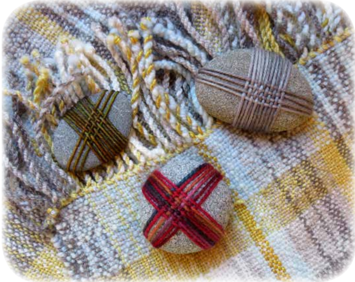
Weaving around a Salish Sea stone lets you swatch your yarn. I wove this throw with odds and ends from my stash.