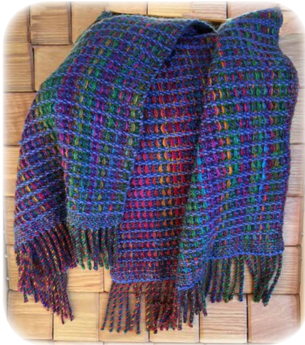
This throw uses a fun pick-up stick technique that last year's new weavers fell in love with.

I start every retreat by teaching brand new weavers. Even returnees learn something new with this review. Participants often comment that our diversity of skills is one of the best things about the retreat.