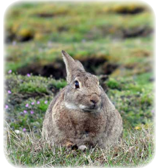
100s of rabbits live above South Beach, where you can collect Salish Sea stones.