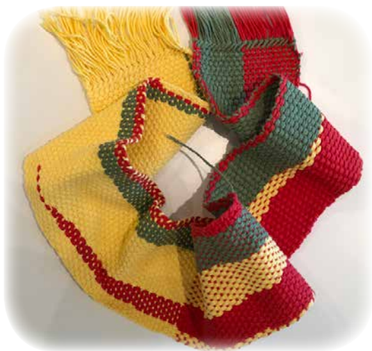
An experimental clasped warp!