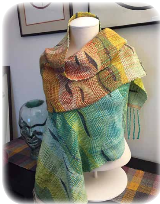
Making waves with Salish Sea Shuttles