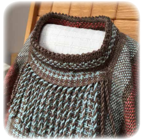
Weaving and knitting merge—it's hard to see where one begins and the other ends!