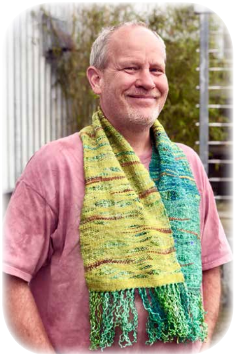
A very pleased weaver