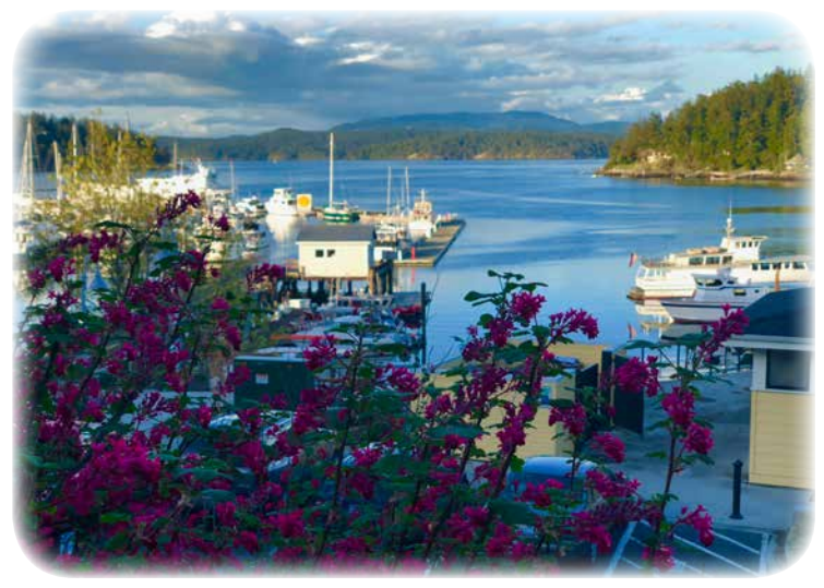
The view from our hotel

Questions? Call the Island Inn at 360.378.4400