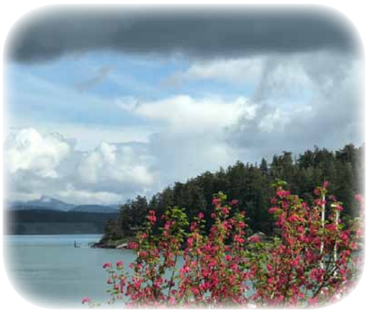
The weather is fresh and alive.