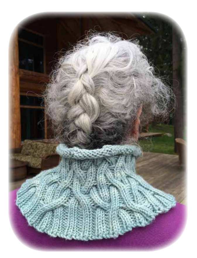
Some of the projects I will teach are old favorites; others are being designed just for this retreat.

Just outside our door you can visit shops, the Whale Museum, coffee houses, bookstores, art galleries, bakeries, and our local yarn shop, Island Wools. You can wander the docks and imagine life aboard the boats, linger in the waterside park, hike out to the University of Washington Marine Labs, knit alongside a new or old friend, or visit an alpaca farm. If you have a car (or rent one on the island) you can drive to South Beach to fly kites or collect agates, and may see foxes, rabbits, and eagles. We'll spend one afternoon riding the inter-island ferry (just steps from our hotel), gliding from island to island and enjoying the scenery while we knit.