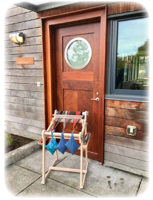
The Inn is very beautiful.