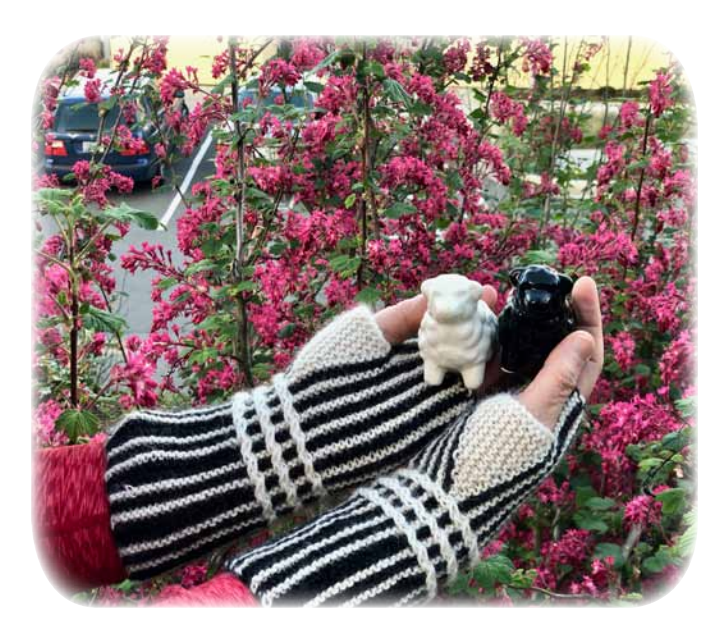
I can teach you to knit a variety of fingerless mitts.

You'll arrive Sunday afternoon and depart Friday morning, giving us four complete days together. Afternoons are free to explore, take a nap, go for a hike, or simply knit peacefully with your new friends. We'll share group time from breakfast to lunch, and in the early evening after dinner. No activities are scheduled for Sunday or Friday, which are arrival and departure days.