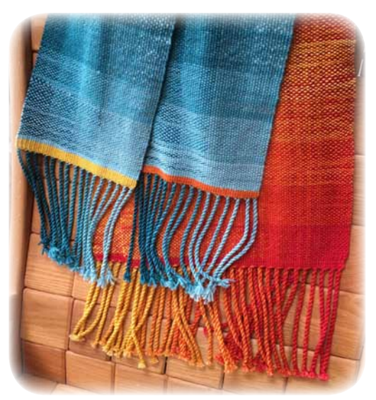
We might do a bit of weaving.