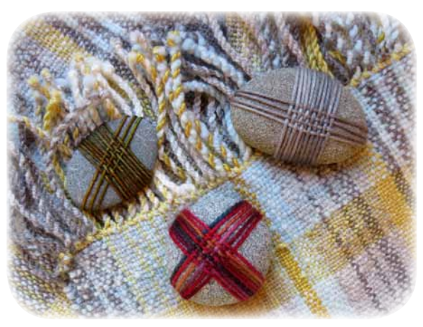
Stones from South Beach, with yarn.