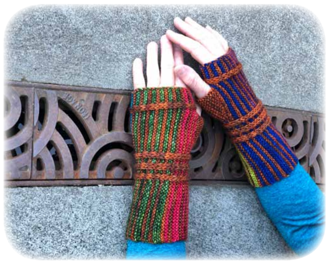
This drain flows through the Inn's outdoor areas.