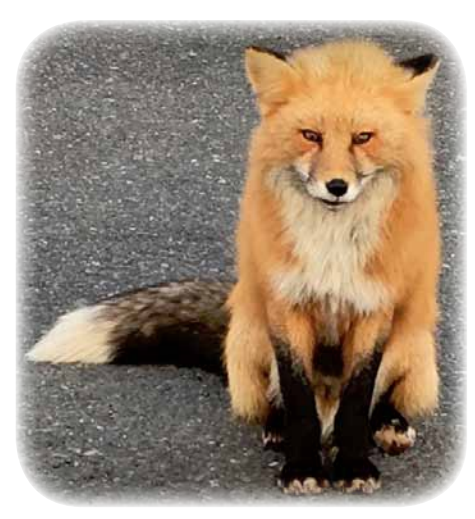
We have lovely foxes.