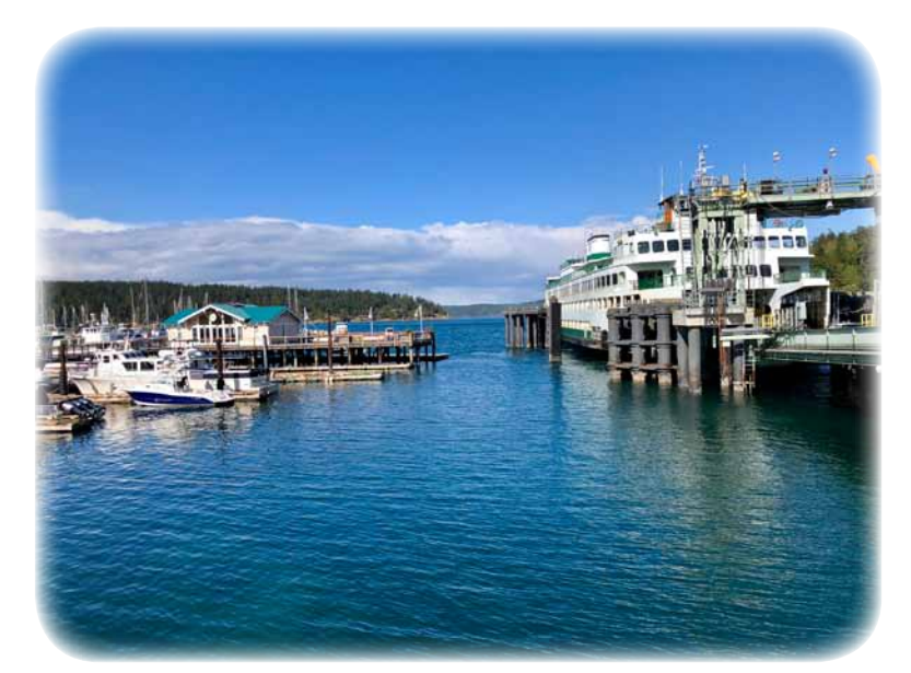
The view from our hotel

Questions? Call the Island Inn at 360.378.4400