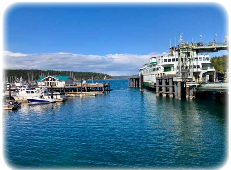
The view from our hotel

Questions? Call the Island Inn at 360.378.4400