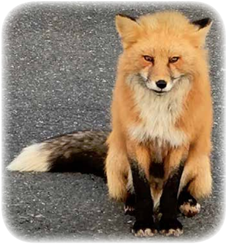
We have lovely foxes.