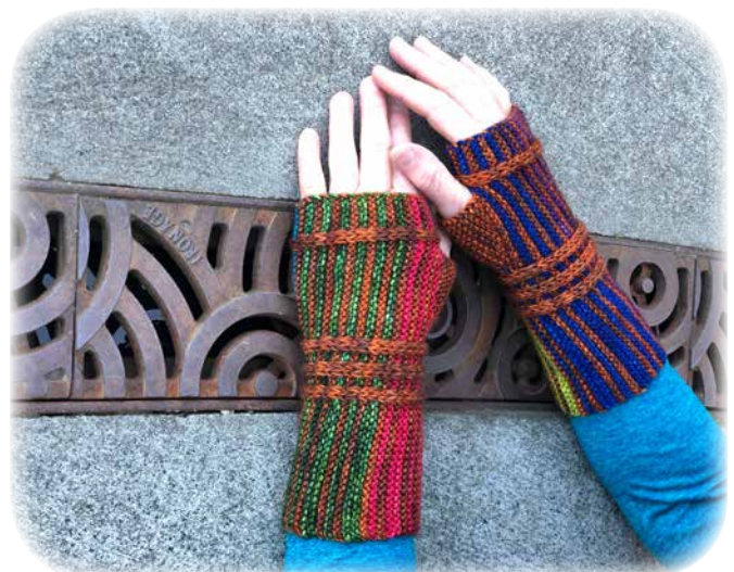
This drain flows through the Inn's outdoor areas.