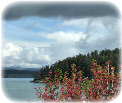
The weather is fresh and alive.