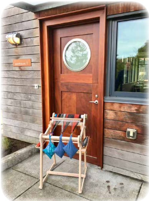
The Inn is very beautiful.