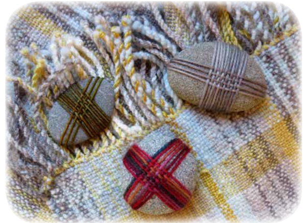
Stones from South Beach, with yarn.